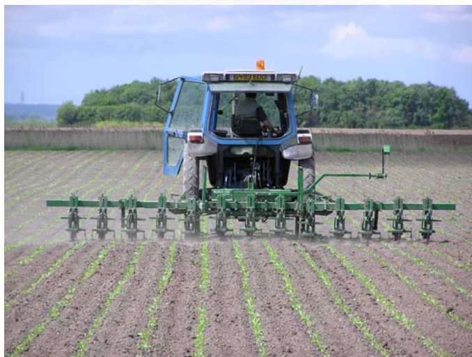
Picture: ROBOCROP performing high speed inter-row cultivation in a sugar beet crop near Peterborough, UK.

Further enquiries to Malcolm Taylor : 0358 722 892 email: malcolmc.taylor@bigpond.com